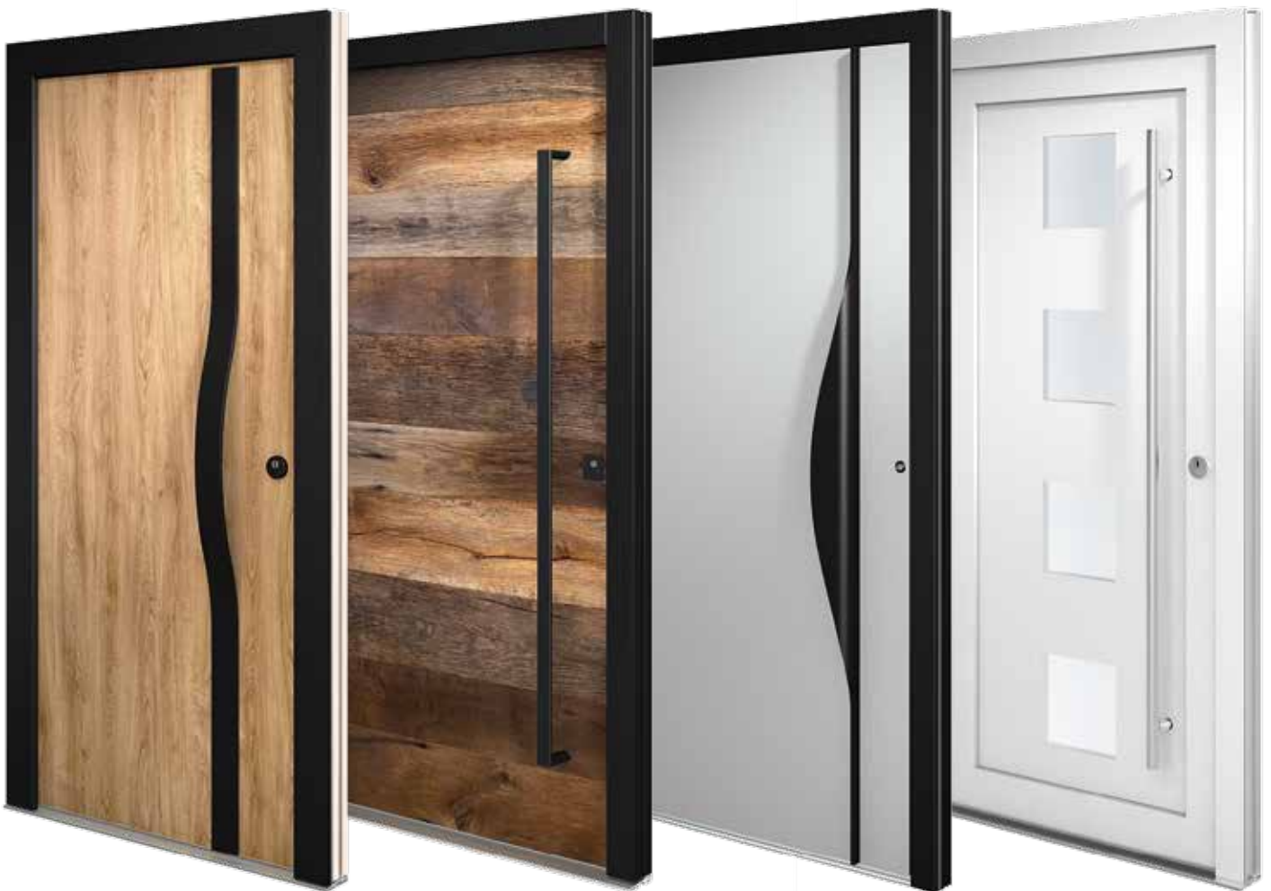
ALUMINIUM-WOOD FRONT DOORS

An innovative, technically mature front door fulfills its tasks for many years and looks very good at the same time!